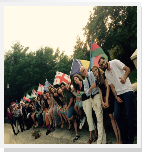
Graduate Fellowship at Rondine Cittadella della Pace (Italy)

Opportunities within your 4 years as an HRS major: