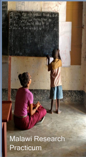
Malawi Research Practicum

Do you want a major that will make a difference in the world?